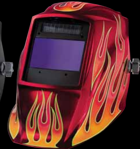
Red Flame - 216323