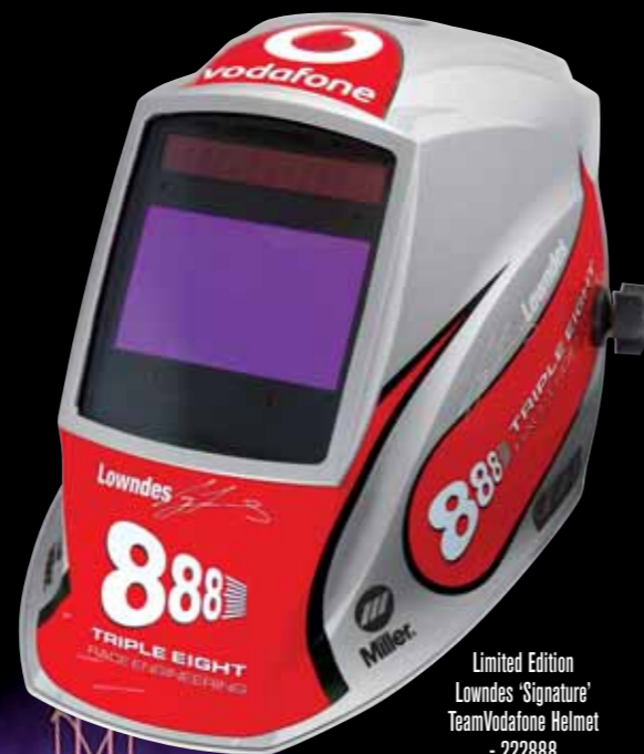
Limited Edition Lowndes 'Signature' TeamVodafone Helmet - 222888