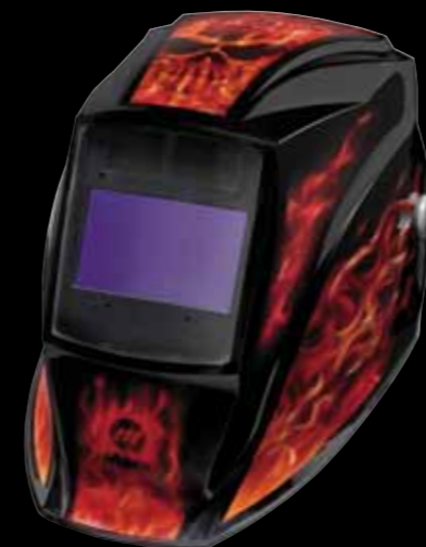
Inferno - 222669