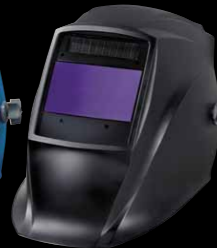
Black - 216322