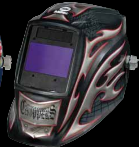
Orange County Chopper - 222671

The ultimate helmet for the most demanding applications.