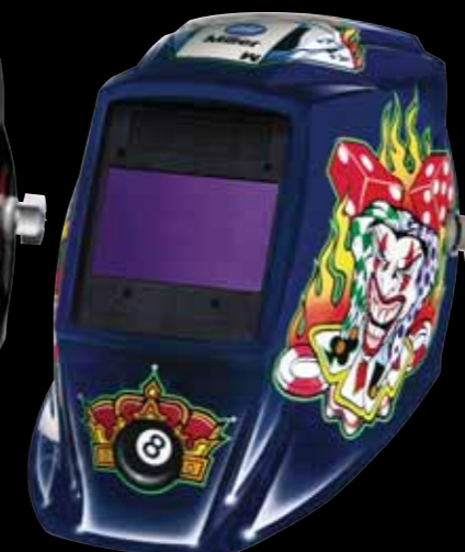
Joker - 227187