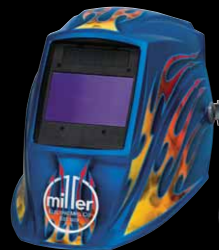
Roadster - 224870